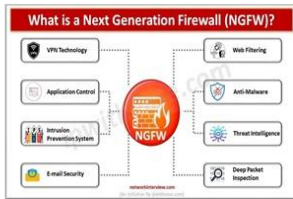
Figure 1: Next-generation Firewall (NGFW)

threats, which can be incorporated into the NGFW. Finally, Deep Packet Inspection (DPI) makes it possible for the NGFWs to have a glimpse at the data being ferried across the network and get a chance to eliminate any malicious traffic, even in cases where the traffic is encrypted.