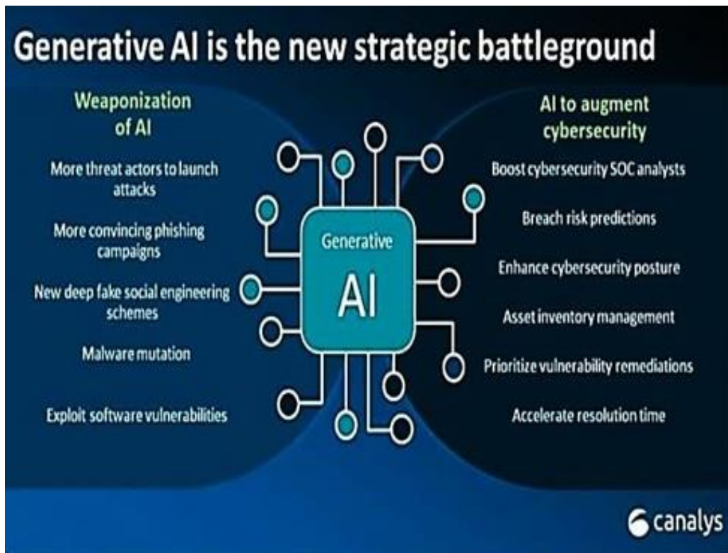
Figure 2: Adaptability to New Threats

On the opposite end of the scale, NGFWs provide Web Filtering and Anti-Malware that guarantees that users using the internet from the cloud environment are safeguarded against malice and malware. Threat intelligence enriches firewall capability, adding the capability to receive updates on newly identified threats to allow the NGFW to respond quickly to new threats. Finally, Deep Packet Inspection (DPI) provides the NGFWs with the chance to inspect the information flowing across the network so that it can detect and stop sophisticated threats from infiltrating through encrypted traffic.