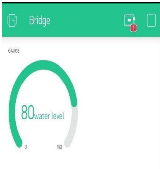
Figure 3 Water Level