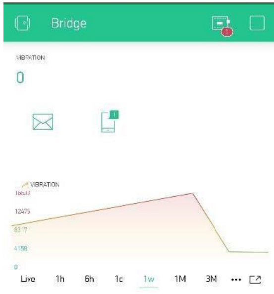
Figure 2: Overall Application