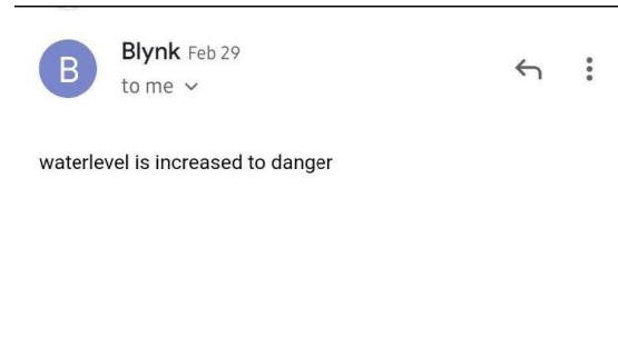
Figure 5 water level notification