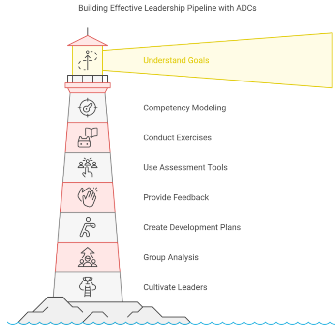
Figure 3: Building Effective Leadership Pipeline with ADCs