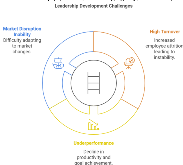
Figure 2: Leadership Development Challenges

Traditional and unstructured approaches to leadership development often fail to address critical skill gaps, align with strategic goals, or prepare leaders for future challenges. Without a systematic framework, organizations risk high turnover, underperformance, and an inability to adapt to market disruptions. The absence of effective leadership assessments and targeted development plans hampers the ability to cultivate high-impact, resilient leaders. There is a pressing need for comprehensive strategies to transform leadership pipelines, ensuring agility, resilience, and sustained organizational success.