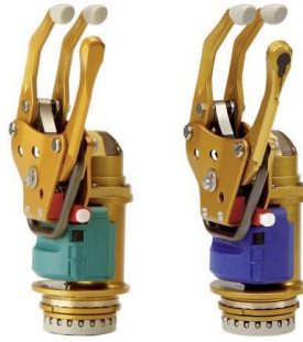
Figure 2: Electric Arm