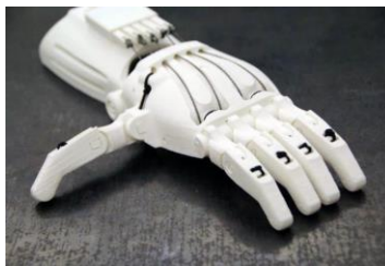
Figure 1: Threaded Arm

This method's idea is to tie a knot in a fishing line or thread at the tips of the fingers, then link that same thread to the wrist or another location on the forearm. The fingers then fold as the wrist rotates, pushing the threads back. In order to draw the strings using this method, you must move your wrist. Nevertheless, it's a great solution because it can be made for a very low cost using the latest 3D printers, and the parts are easy to design and even available for free online.