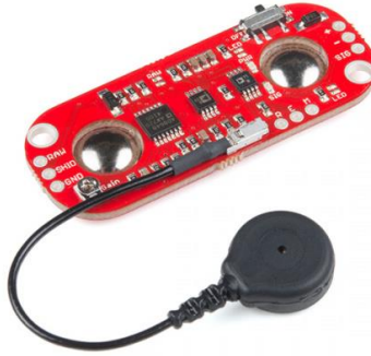
Figure 5: EMG Sensor (AT-04-001)

board rather than utilizing biomedical pads separately and connecting them with wires. Figure 3.1 depicts Myoware Muscle Sensors, and table 3.1 provides electrical specifications for the sensor.